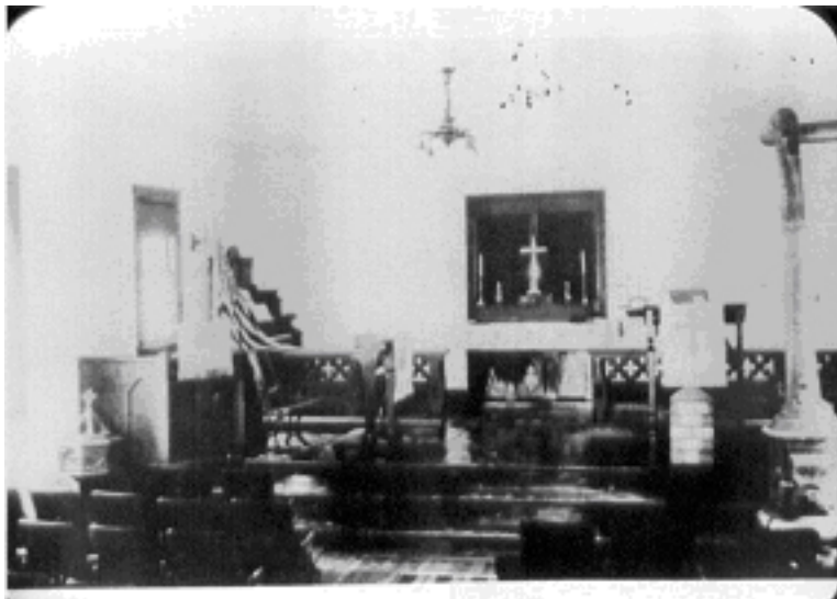
Inside Union Street Church 1922; Baptismal Font, Altar and other items we have in the nave or chapel.