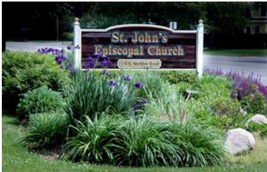
St. John's Episcopal Church on Sheldon Road (photo 2010).

St. John's Episcopal Church continues to be a vital part of the Plymouth community, bringing the Gospel message to all.