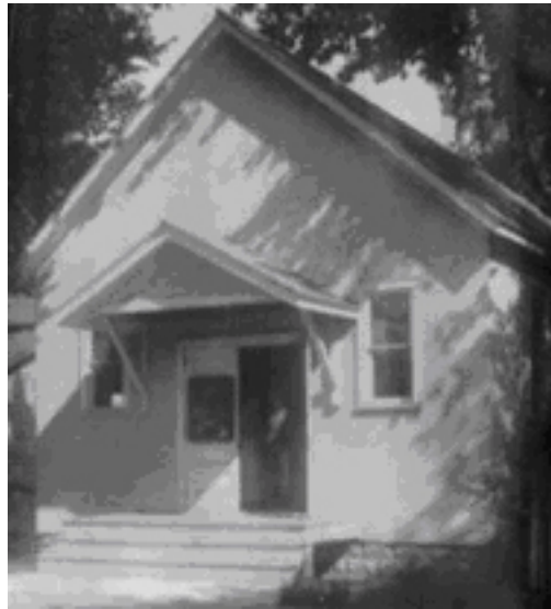
First Church built on Union Street and occupied 1920-27