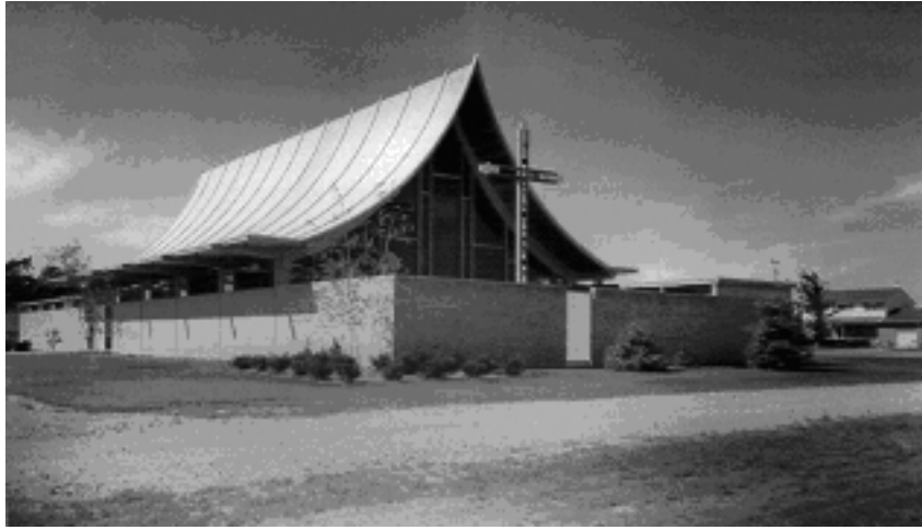
The current church building at 574 S. Sheldon Road was occupied from 1960 to present. The rectory visible in back built 1952 (converted to current youth house in 2007).