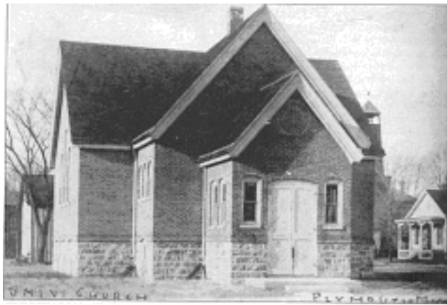
Rented Universalist Church, 1912-1920