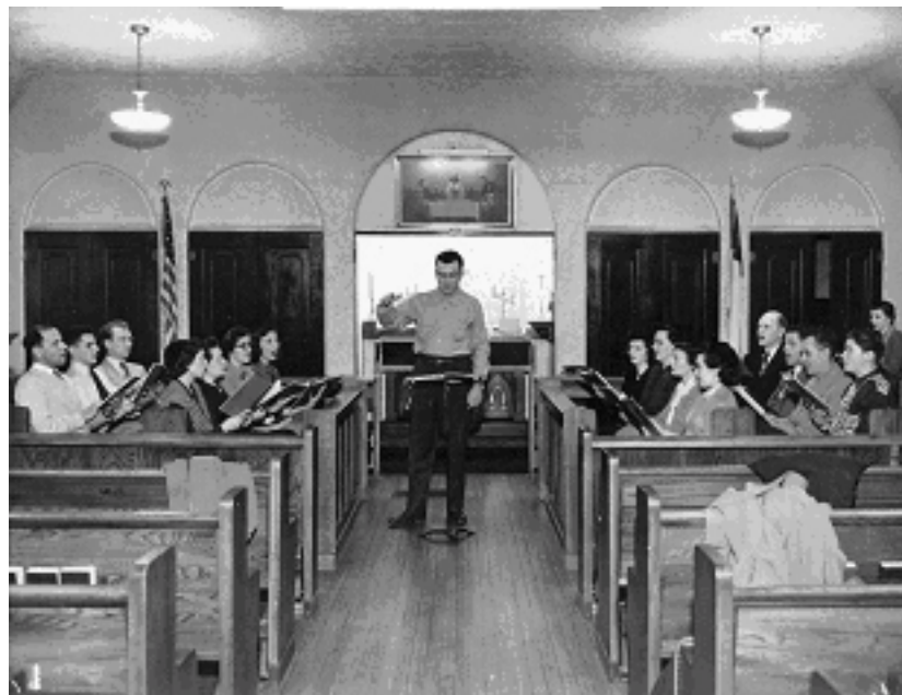
Inside church at 1013 Maple Avenue, West (taken about 1950).