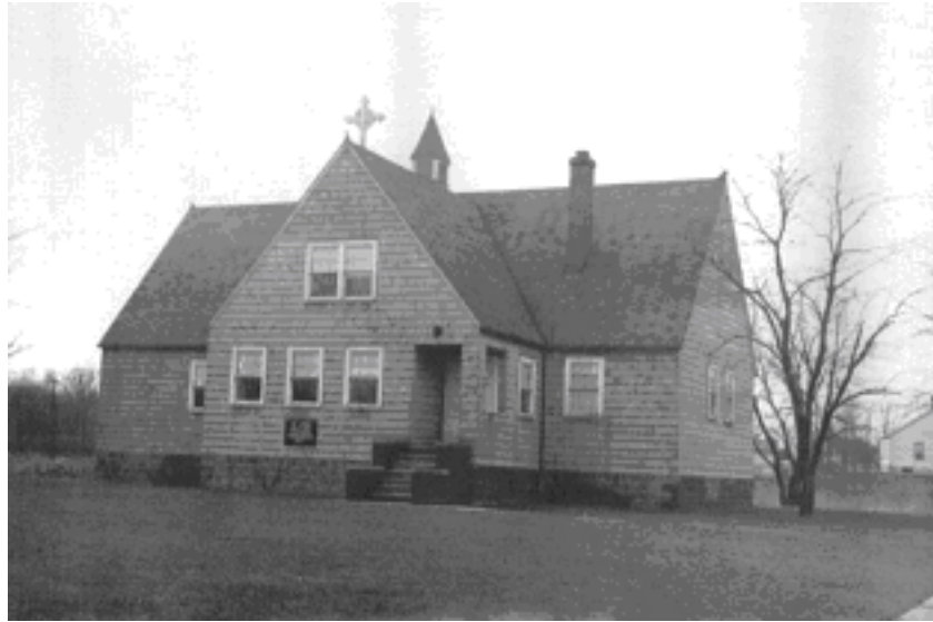
Second Church built corner of Maple and Harvey Streets, and occupied 1927-60